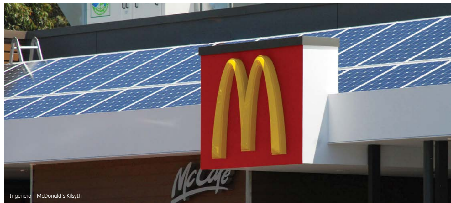
Ingenero – McDonald's Kilsyth

Please note that government programs are subject to change. The information listed here is current as of January 2019. Please refer to the websites referenced for latest program updates.