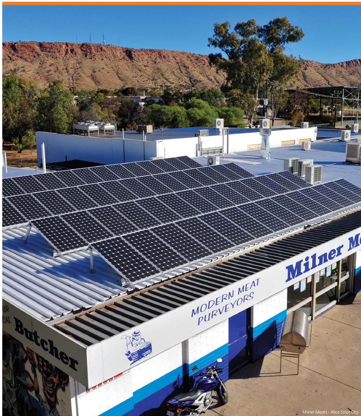
Milner Meats - Alice Solar City