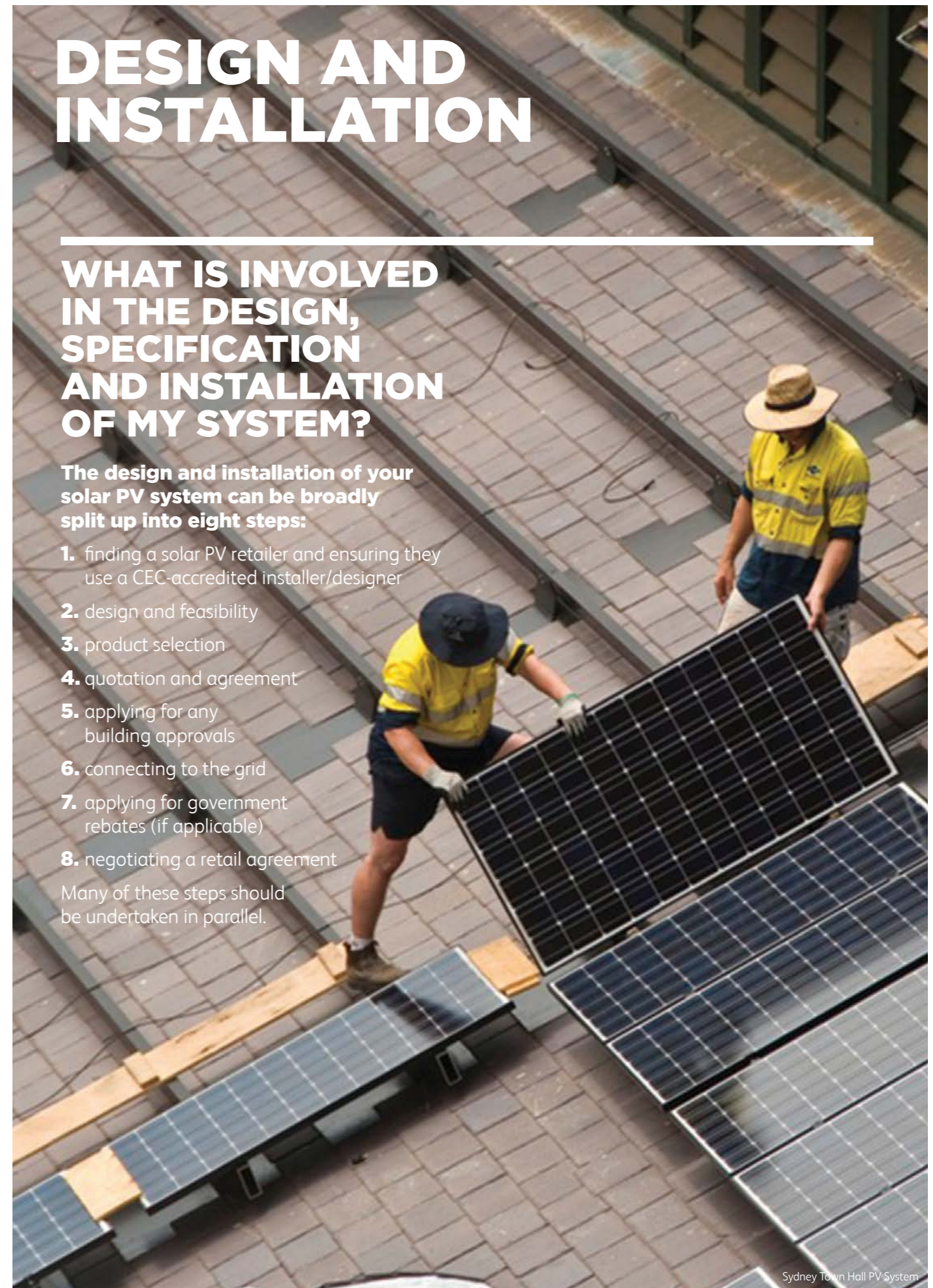
Sydney Town Hall PV System

Many of these steps should be undertaken in parallel.